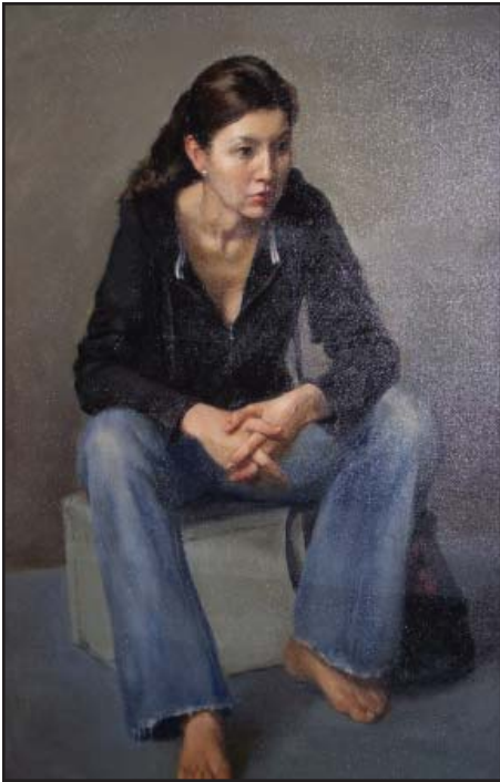
Best of Show Winner and First Place Winner in Oils/Acrylics " Bearfoot" by Chong-Sun Oh.