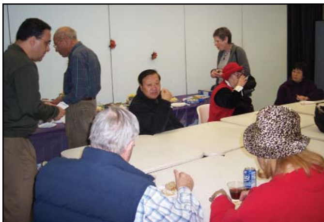
Some members enjoying the food and conversation.

The Art Association held its annual holiday party on December 18th. There was great food and snacks, holiday music to enjoy, a grab bag, and our "Artist's Choice" fun awards presentation. Below are a couple of pictures from the party.