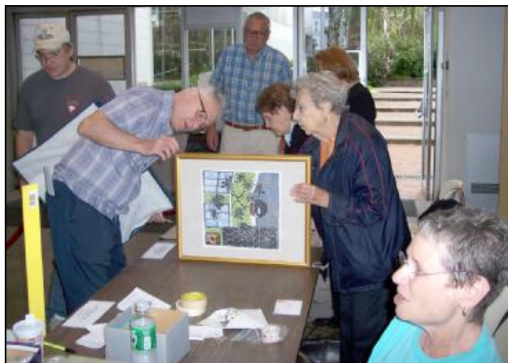
Registration volunteers checking in an entrant's painting.