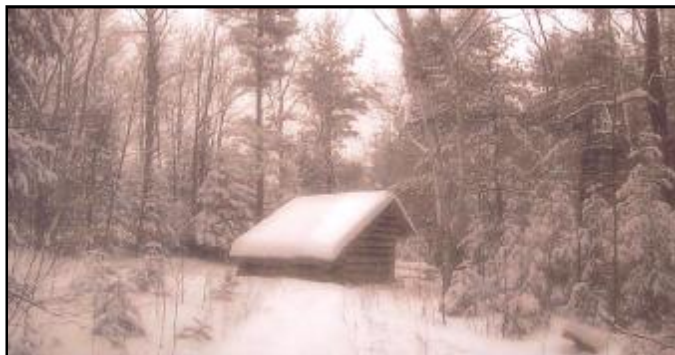
Digital Art/Photography Winner "Lean-To Dream" was Chip Perone's winning entry.