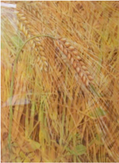
Pastel - Stanley Lapa - Autumn Leaves