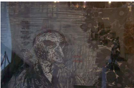
Mixed Media - Liming Twanmoh - Pears