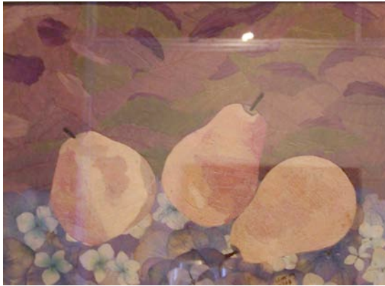
Photography - Cristina Cerone - Wishing On the Moon