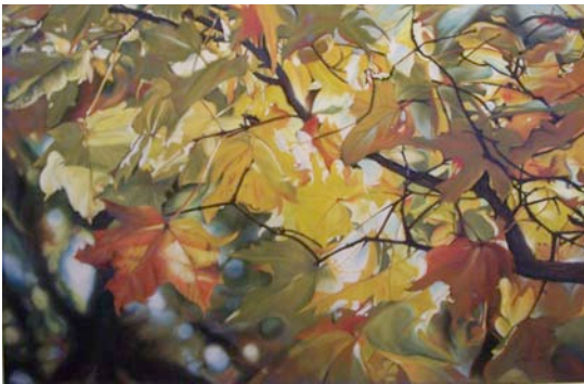
Graphics - Don Axleroad - Portrait of Alzheimers